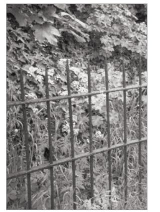
Traditional metal railings