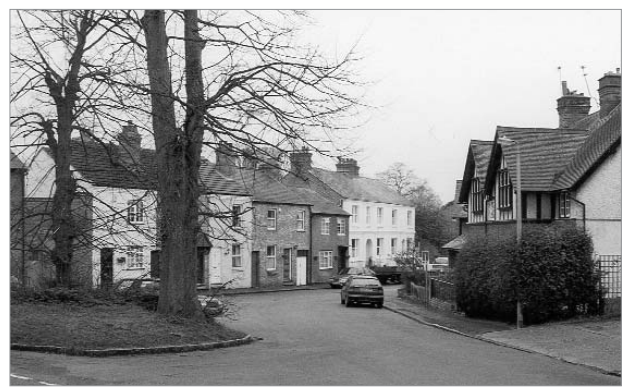
A green space enclosed by buildings of domestic scale and traditional appearance