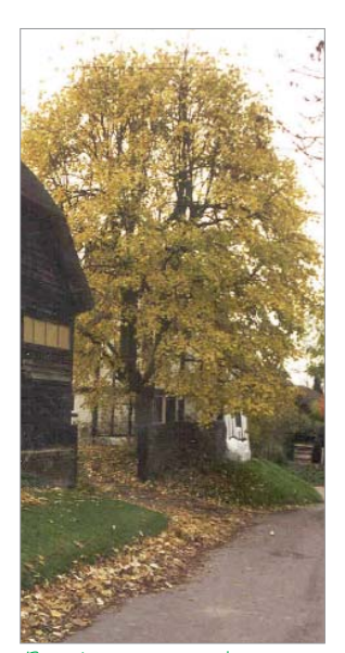
Prominent tree and grass verges