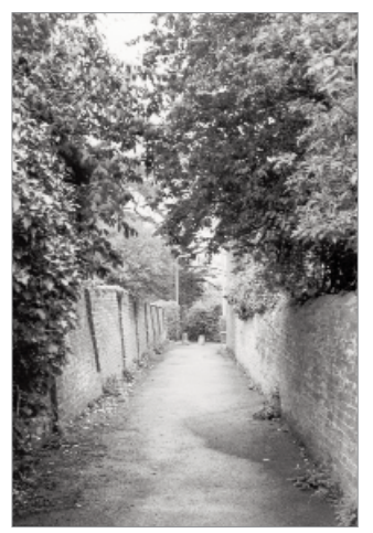
Footpath with brick boundary walls and trees