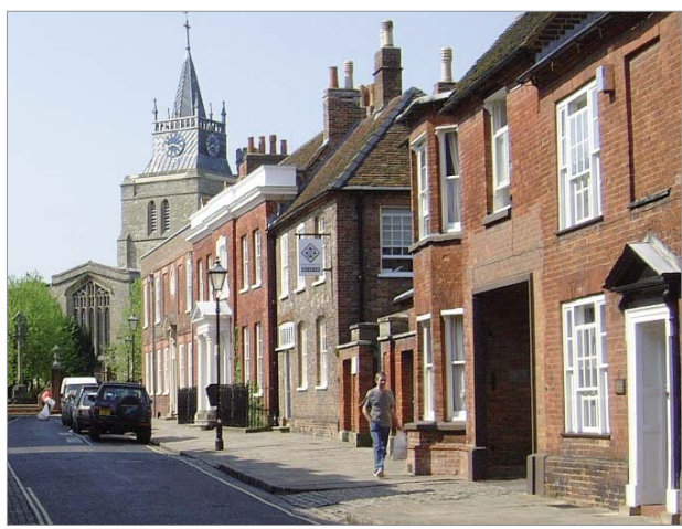
Historic urban street scene

The principal purpose of Conservation Area designation is the official acknowledgement of the special character of an area. This will influence the way in which the Local Planning Authority deals with planning applications which may affect the area. Within Conservation Areas, permitted development rights are restricted, which means that applications for planning permission will be required for certain types or work not normally needing consent.